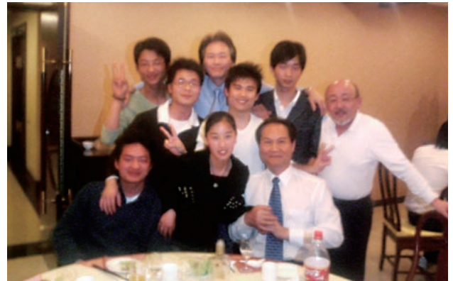
At Beijing branch