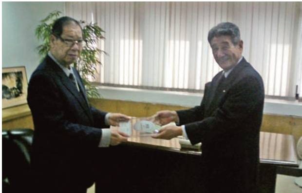
At Taiwan GMB on February 9, 2009